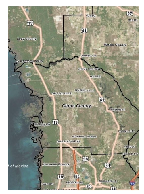
Figure 13-5. Citrus County coast

The purpose of the project is to add a network of artificial inshore reefs within Citrus County, to provide greater recreational opportunities for residents and tourists. The