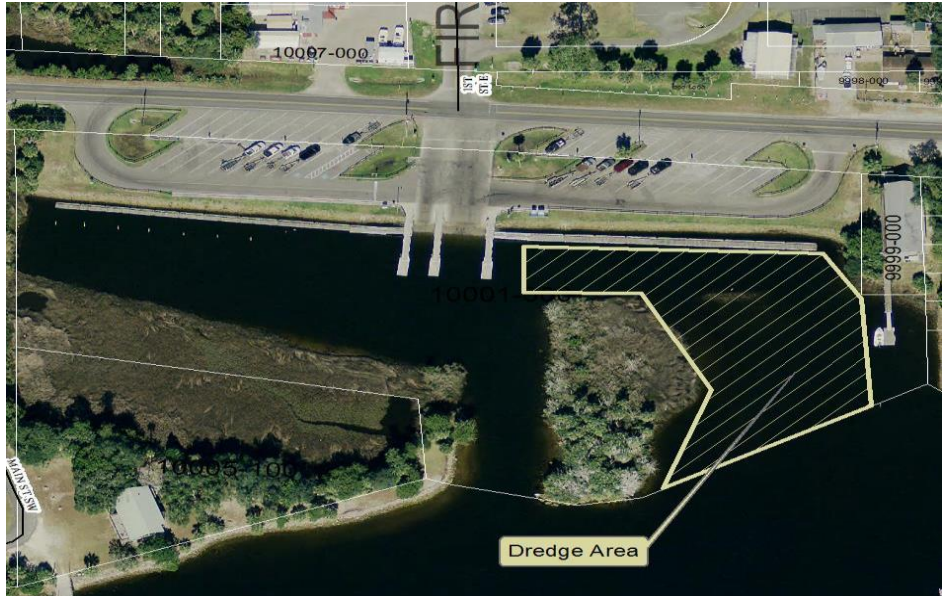
Figure 10-4B. Steinhatchee Boat Ramp

Recreational fishing, boating, and scalloping has an economic impact of over $16M on the Taylor County economy and tourism trade. This accounts for more than 95% of tourism in the County. As a fiscally constrained County, one designated as an area of economic concern, and a Rural Area of Opportunity (RAO), access to the Gulf is absolutely critical to the County. The local commercial fishing industry is largely dependent on access to the Gulf via Keaton Beach Boat Ramp and Steinhatchee Boat Ramp.