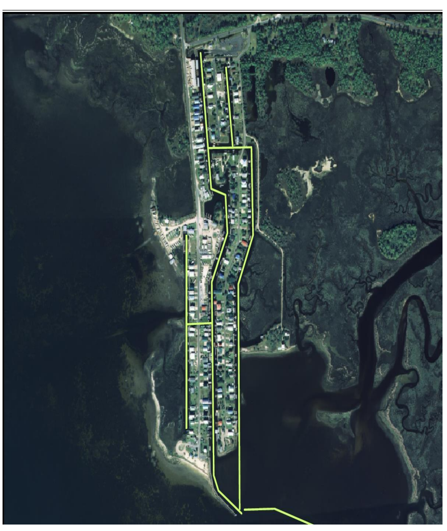
Figure 10-4A. Keaton Beach Boat Ramp

This coastal dredging project involves the dredging and removal of sediment that has accumulated in the canals, channels, and basin over the years for Keaton Beach and Steinhatchee Boat Keaton Beach involves Ramps. approximately 12,000 linear feet of canals and channels. Steinhatchee involves the dredging of the basin and associated channel which is approximately one (1) acre. The dredging will ensure accessibility to the Gulf at both boat ramps which is frequently restricted during low tides due to the lack of dredging. Access to the Gulf is critical for the County's economy and tourism development and growth. The dredging is also critical for access to the Gulf for the commercial fishing industry in the Big Bend region. The location of Keaton Beach Boat Ramp and associated canals and channels is shown in Figure 10-4A. The location of Steinhatchee Boat Ramp and the basin and channel is shown in Figure 10-4B.