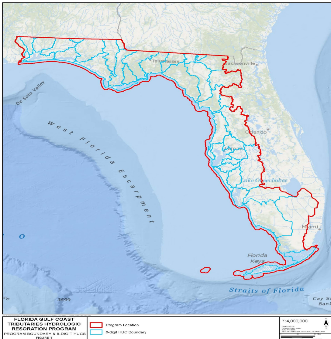
Figure 1: The THRP boundary which includes all 5-digit HUC8 watersheds that flow to the Gulf of Mexico.